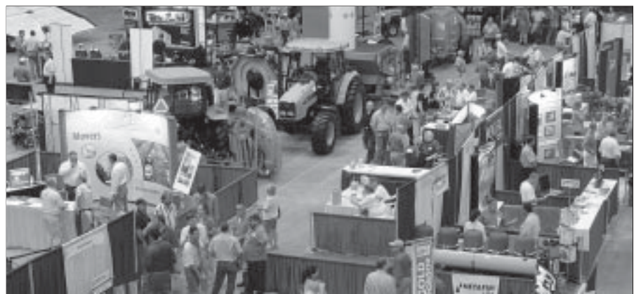
The 2007 Citrus Expo trade show promises to be "first class."

The seminar planning committee is again developing a program "by growers...for growers"! Norm Todd, GCGA