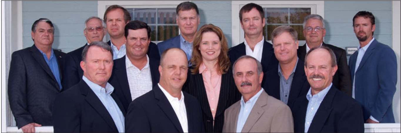
2008-2009 Gulf Citrus Growers Association Board of Directors