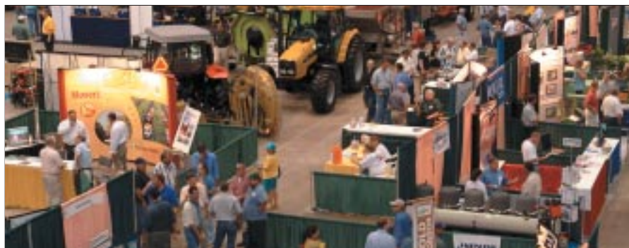
The 2006 Citrus Expo trade show promises to be "first class."