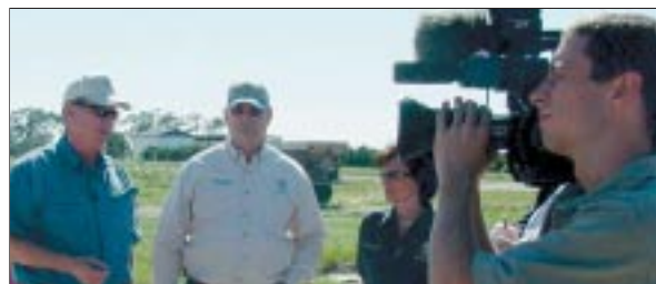
Gulf growers assess Wilma's damage to buildings, fruit and trees! Florida Agriculture Commissioner Charles H. Bronson tours growing region for "first hand" look at the hurricane's destruction.